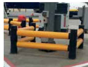
8 Light columns & masts