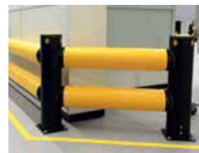
17 Wall protection

Established in 1984, A-SAFE is a specialist manufacturer and supplier of high-performance safety guardrails and associated products. In 2001, we invented the world's first industrial-strength safety guardrail, and for more than fifteen years, we have been at the forefront of airport safety.