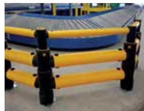
12 Baggage halls