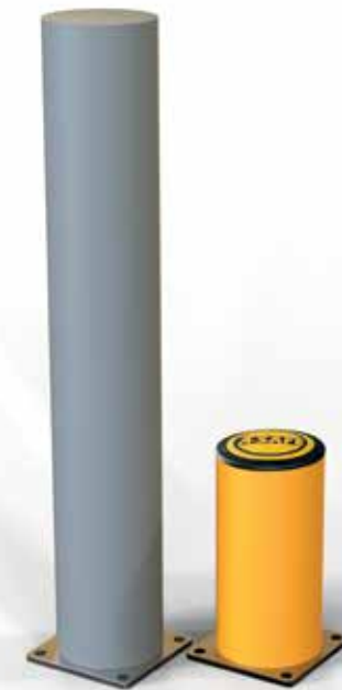
330ft steel guardrail