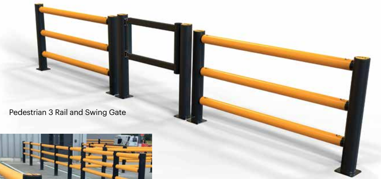
Pedestrian 3 Rail and Swing Gate