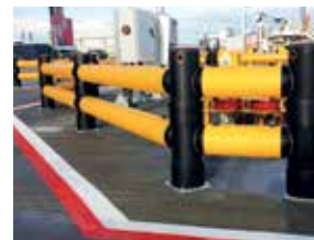
6 Fixed Electrical Ground Power