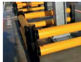
20 Case studies