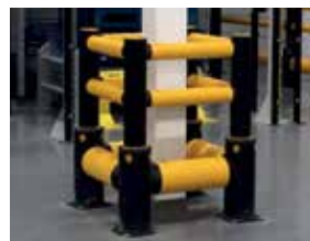
14 Column protection