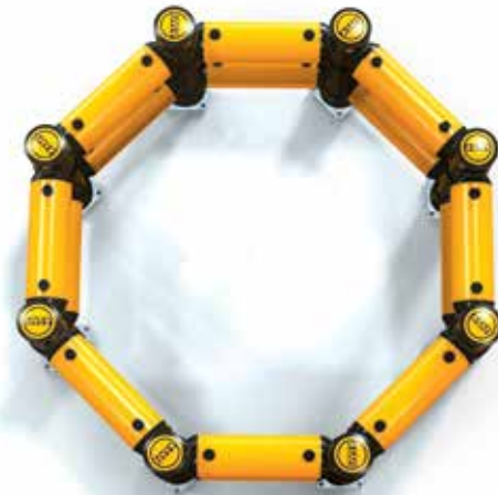
Double Traffic Polygon