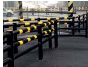
10 Pedestrian walkways