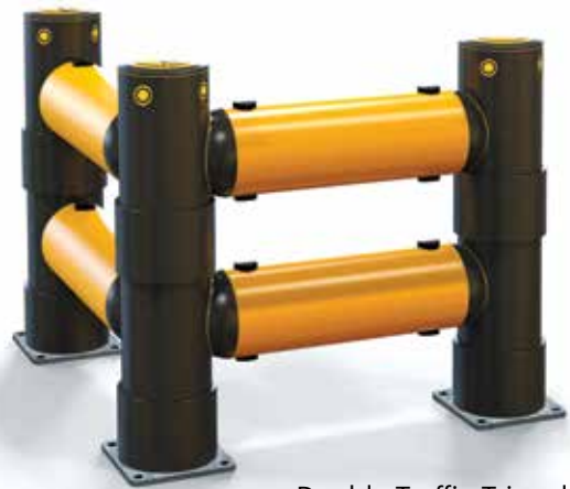
Double Traffic Triangle