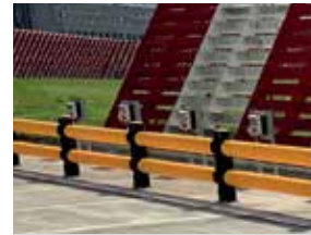
16 Tug charging