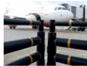
4 Service roads