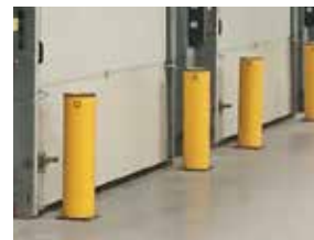
17 Door protection