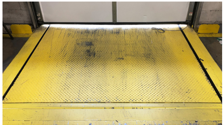
Same dock shown after 18 months service.

Slippery diamond plate dock levelers made a Philadelphia distribution center unsafe, especially during rainy days. Banks Industrial Group mitigated this hazard through the rapid application of a non-slip, high-adhesion Belzona coating resistant to impact and abrasion. Unlike adhesive strips, this coating will not peel away and will provide a long service life, applied and cured quickly. This loading dock was repaired and returned to service within 48 hours.