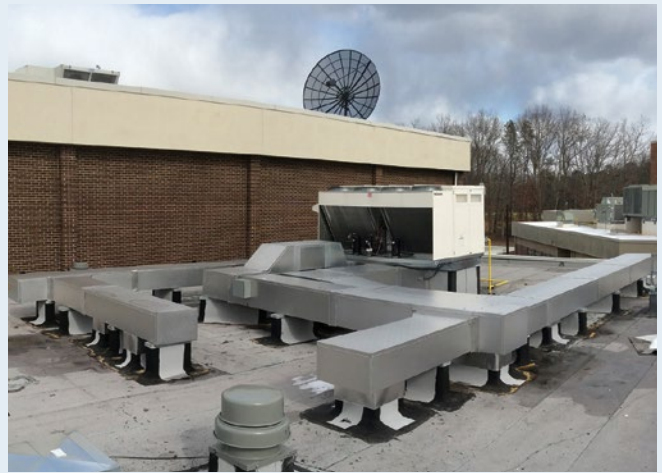
Attractive white and embossed aluminum finishes.