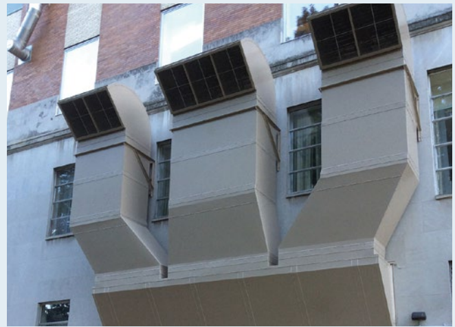
Vertical runs are easy.