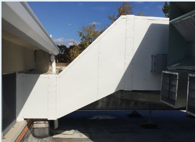
Transitions are no problem.