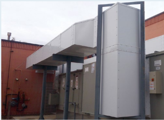
Durable double-layer construction with R-16 thermal rating.