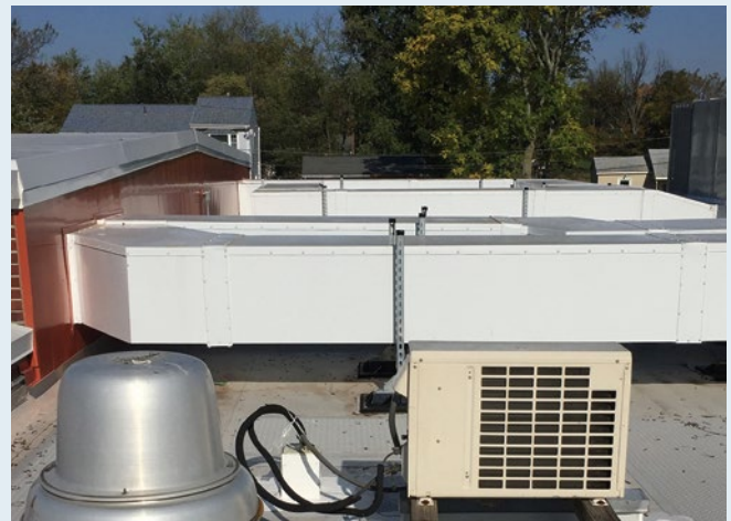
Wall penetrations are easy to install.

New construction or retrofit, BIG can maximize your building's HVAC efficiency ...contact us to find out how.