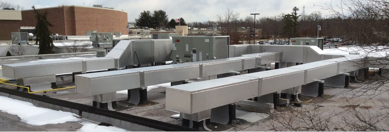
Fast, one trade installation.