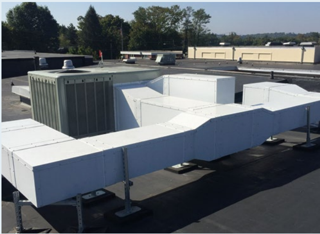
The best choice for schools and hospitals.