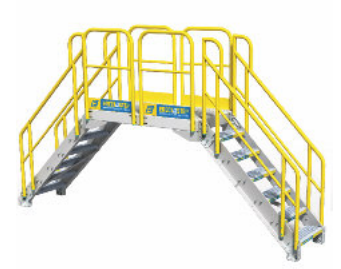
6-Step Industrial Crossover