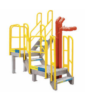
Custom Modified Crossovers & Platforms