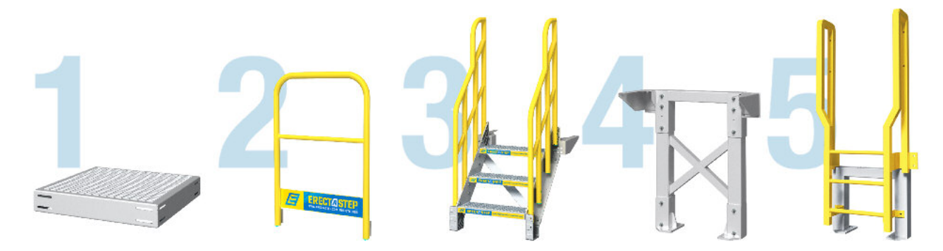
Modular parts from inventory made this solution flexible and fast.

BIG responded by compressing the schedule in three ways: