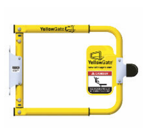
YellowGate Industrial Swing