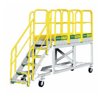
Rolling Work Platforms