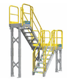
Industrial Mezzanine Access