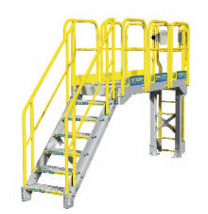
Catwalk Crossover with Ladder