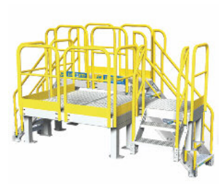
Low Access Maintenance Work Platform