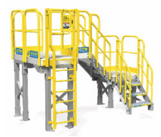
Multiple Level Step-up Platform with Ladder