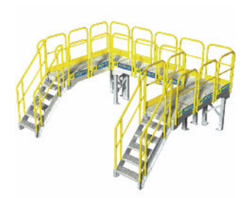
Assembly Line Crossover